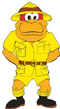
APES rule the jungle!

Thank you to all the parents and family who helped with the Halloween parties and parade. We had over 200 additional people in the building on Halloween day.