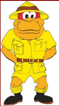
APES rule the jungle!